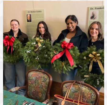
Participants show off their beautiful holiday wreaths during the co-hosted workshop with Garden Aurora.