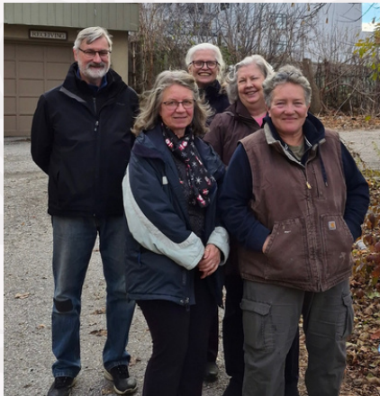
Garden Aurora volunteers after decorating Hillary House for the holiday season, bringing festive charm to the historic site.