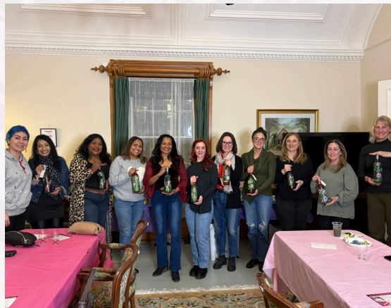
Guests enjoying a Galentine's Day paint night workshop co-hosted with Royal Rose Art Gallery.

Want to be involved at the AHS? Contact us for more information on volunteering. (Click here)