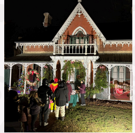
Parade-goers stopped at Hillary House for a cozy cup of hot chocolate during the Santa Under the Stars parade.