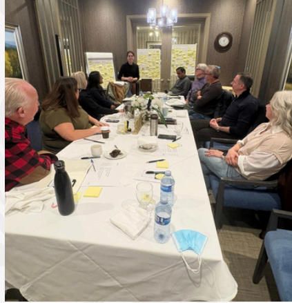
AHS Board of Directors engaged in a collaborative strategic planning session, aligning priorities for the years ahead.