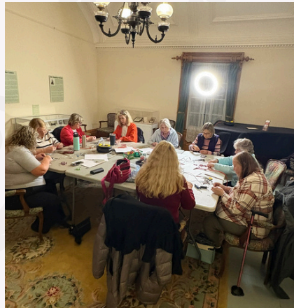
Leaders from the local Girl Guide Trefoil Guild participate in a holiday workshop at Hillary House.