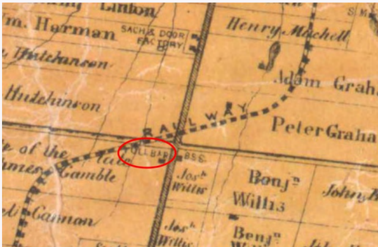
The Aurora toll booth, located at the southern end of town where the railway crosses Yonge Street, can be seen on this 1860 Tremaine's Map of the County of York, Canada West.