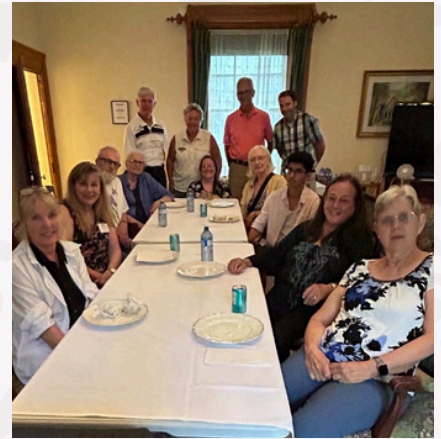
AHS Volunteers pose in the Ballroom at the Volunteer Appreciation.