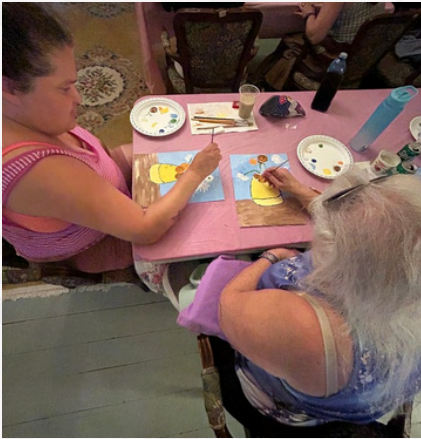
Guests enjoy a relaxing evening at the AHS Paint Night in partnership with Royal Rose Gallery.

Have a look at what the AHS has been up to since the Summer! Did you attend any of our events?