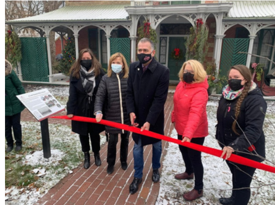
Exhibition Opening and Ontario Trillium Foundation Grant Recognition

Three editions of the AHS newsletter, The Attic, were published and made available to members and supporters to update them on the status and activities of the AHS during 2021. These communications were supplemented by brief monthly AHS News updates.