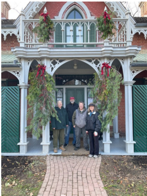
Garden Aurora volunteers decorating Hillary House