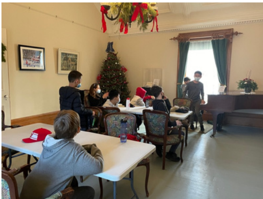
Students from St. Andrews College

The AHS has a long history of being actively visible in the Aurora community. Although COVID-19 restrictions continued to force the cancellation of most outreach opportunities, the AHS was represented at two outreach events at Town Park in association with Culture Days.