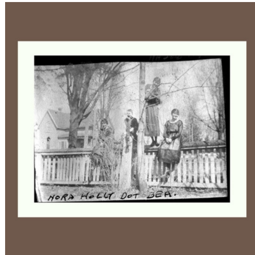
Throwback Thursday Social Media Post