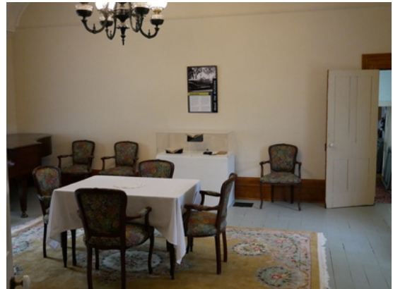
Hillary House Ballroom, 2021

In 2021, the AHS undertook the restoration of the Hillary House verandah. Work began in August and included structural stabilization and replacement of the verandah underpinnings; complete replacement of the iconic latticework around the verandah; and repainting of lattice and verandah floorboards in-line with heritage reconstruction. The project was completed in early November and will provide improved structural safety to the verandah space, allowing for increased programming space and public access to the museum for years to come.