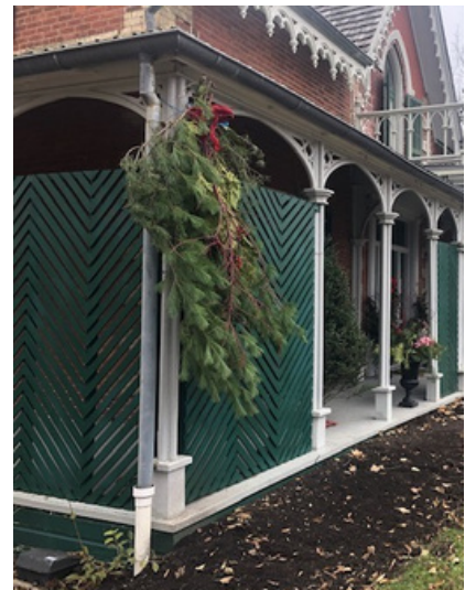
Hillary House verandah during and after restoration