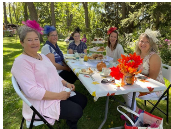
Victorian Harvest Tea

Continuing the success of our past educational programs, a variety of curriculum-based programs were presented to several different classes from St. Andrew's College through their Community Giving Program and one Girl Guide group.