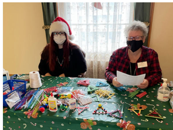
Volunteers at A Family Christmas