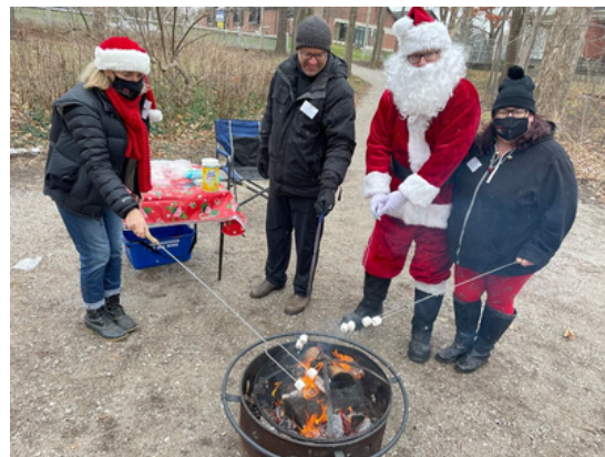
Volunteers at A Family Christmas