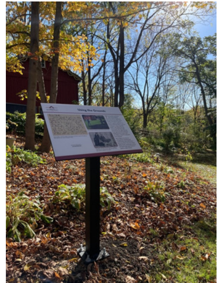
Panel from ' A Look Outside Hillary House '

Inventoried and cataloguing the permanent collection continued. Over 200 artifacts and archival documents were properly catalogued, photographed, or scanned, and added to the collections database.