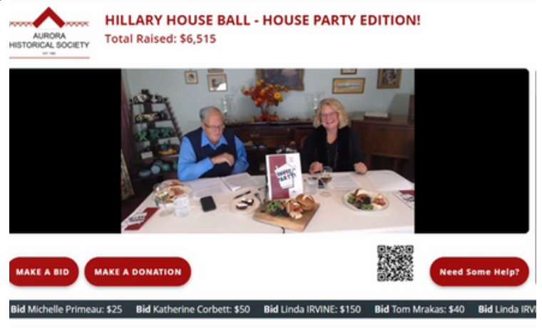
Hillary House Ball - House Party Edition