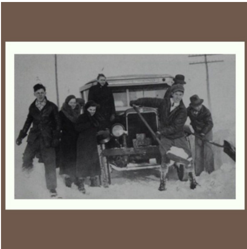
Around Aurora Social Media Post

In mid-2020, the AHS began a new social media strategy to engage current audiences and attract new ones. At the end of 2020, the results of the strategy were overwhelmingly positive, and it was continued. In 2021, the AHS had over 20,600 engagements through social media, an 80% increase when compared to 2020. The AHS also participated in the National Trust for Canada's virtual Historic Places Days and were featured on their social media channels in a "take over" which introduced the AHS and Hillary House to new audiences across Canada.