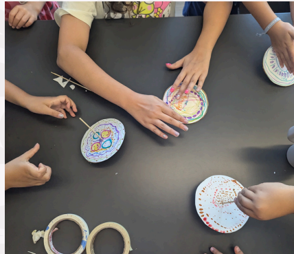
Summer months for the AHS have been preoccupied with providing engaging programming for many local campers.