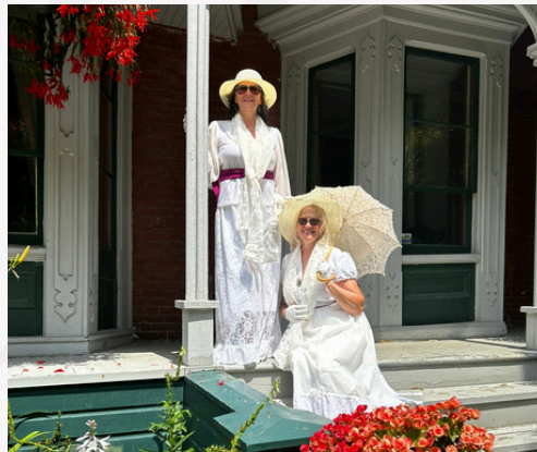
Guests of the AHS Victorian Garden Party all dressed up, enjoying tea and activities on the grounds.