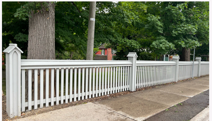
Repaired fence, August 2024.

The AHS contracted local business Hudeck Contracting to complete the necessary repairs. They responded promptly and quickly got to work repairing the three sections affected. We thank them for their professional work and dedication to heritage restoration.