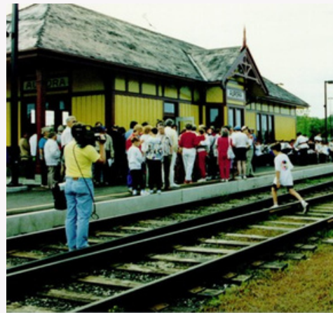
Erection of the provincial plaque at the Aurora Train Station.

times required of our fledgling volunteer group in matters of advocacy, program development, and promotion. How could the AHS best contribute to a new kind of, mid-20th century, cultural modernity, one concerned with the emerging role of historic knowledge, and the contribution of cultural conservation to an increasingly, layered, and complex, mid-20th century, modern world of public affairs?