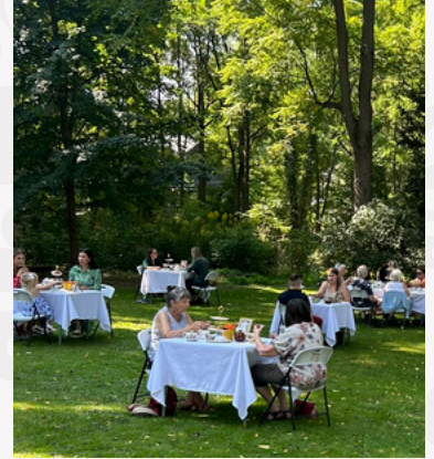
Guests enjoying the weather and afternoon tea at the Victorian Harvest Tea.