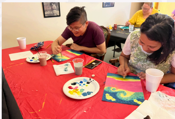
Participants enthusiastically complete their masterpieces at Paint Night, in partnership with Royal Rose Art Gallery & Gifts.