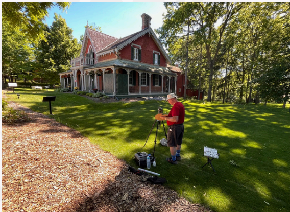
SOYRA artists enjoy the beautiful weather and use Hillary House as inspiration for their latest art pieces at this plein air session.