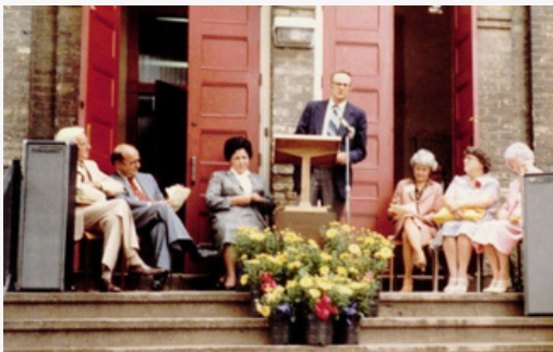
Plaque unveiling at Church St. School.