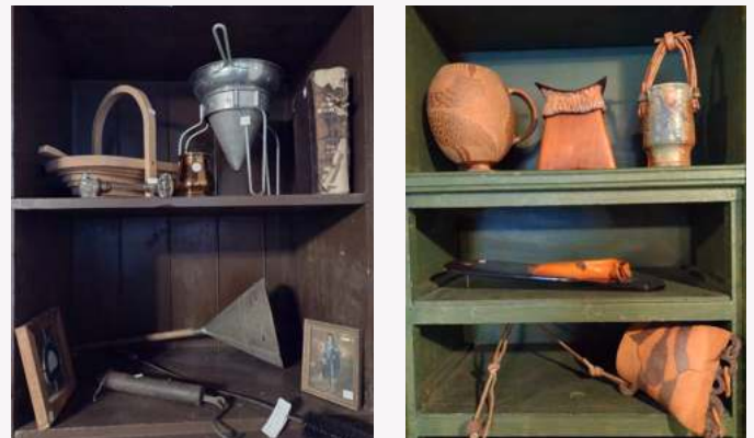
Some highlight items for sale in our Gift Shop, but the shelves have space for more!

Summer starts June 20th, so there is still time to do your Spring cleaning and drop off items for the AHS to sell in the Gift Shop. We accept jewellery, crystal, teacups, gently-used small household items in excellent condition. Unfortunately, we do not accept books or textiles. You can call in advance to arrange a drop off, or alternatively put the items in the Drop Off Cabinet by the south door. Your donations to the Gift Shop are greatly appreciated as it not only rehomes loved items, but the funds help to maintain the AHS's operations.