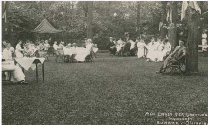
Photo HA2008.1167 from the Hillary House Archival Collection, hand-labelled in the bottom-right as "Red Cross Tea Grounds, Inglehurst, Aurora, Ontario."

Originally, afternoon high tea did not have such a noble cause. Quite simply, teatime served to carry over hunger between lunch and dinner. In the early Victorian period, Anne, the seventh Duchess of Bedford, would be feeling snackish at around 4pm and would thus request some tea, bread and butter. 1