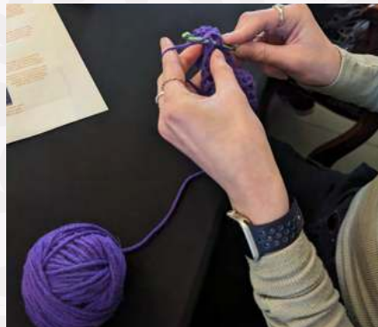
Photo from the Heritage Craft Workshop, Basics of Crochet.