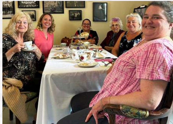
A family enjoying the Mother’s Day Afternoon Tea event inside the Ballroom at Hillary House.

Want to be involved at the AHS? Contact us to be a volunteer, intern, or to join our Board of Directors! (Click here)