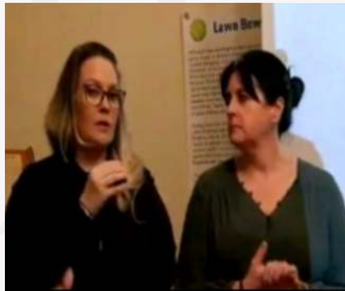
Speaker Series program “Spirits & Stories of Hillary House” with two members of The Paranormal Seekers.