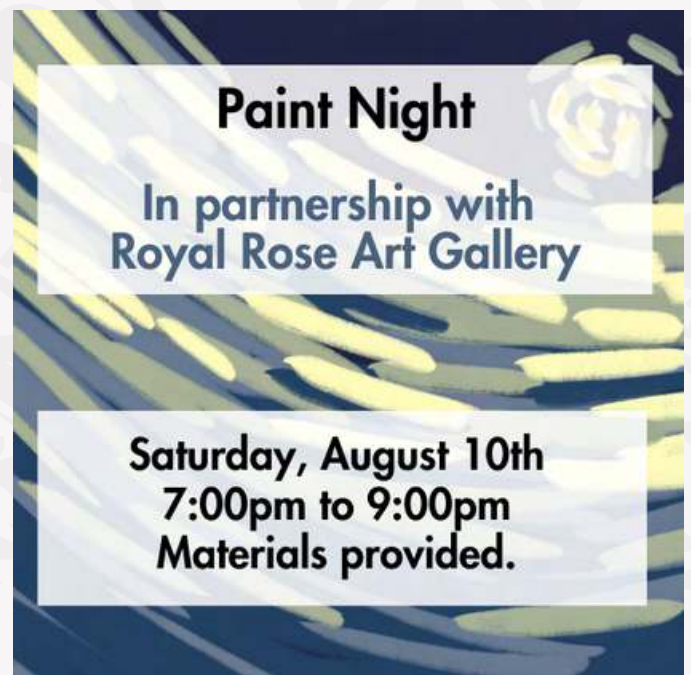
Paint Night In partnership with Royal Rose Art Gallery & Gifts Saturday, August 10th at 7:00pm, In-Person