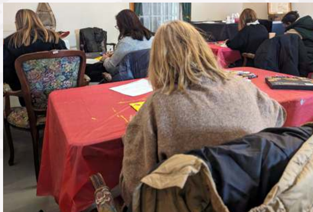
Participants enthusiastically complete their masterpieces at Paint Night, in partnership with Royal Rose Art Gallery & Gifts.