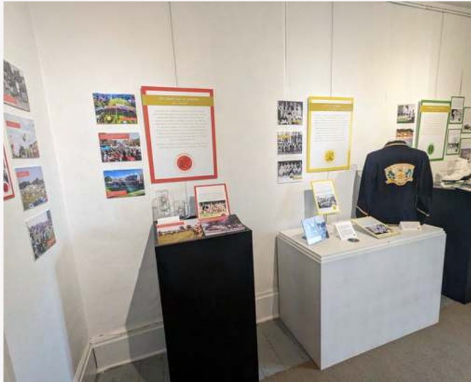
Aurora Through the Archives: Growing Up Aurora

Do you remember the Aurora Horse Show at Town Park, or maybe when it was in Machell Park? What about the Aurora Public Library when it was on Victoria Street, or swimming in the George Street Pool? If you are looking for a trip down memory lane or you are interested in seeing what it was like as a child in Aurora over the last 100 years, visit our new exhibition Aurora Through the Archives: Growing Up Aurora and Through the Hillary Lens , on display at Hillary House National Historic Site from May 6th to June 29th.