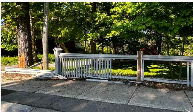
Damage to our heritage fence occurred afterhours on Thursday, May 23rd, 2024.

If you have been past Hillary House in the last couple of weeks, you will have noticed that three sections of the fence closest to the driveway are damaged. On the night of May 23rd, an incident resulted in a vehicle hitting the fence.