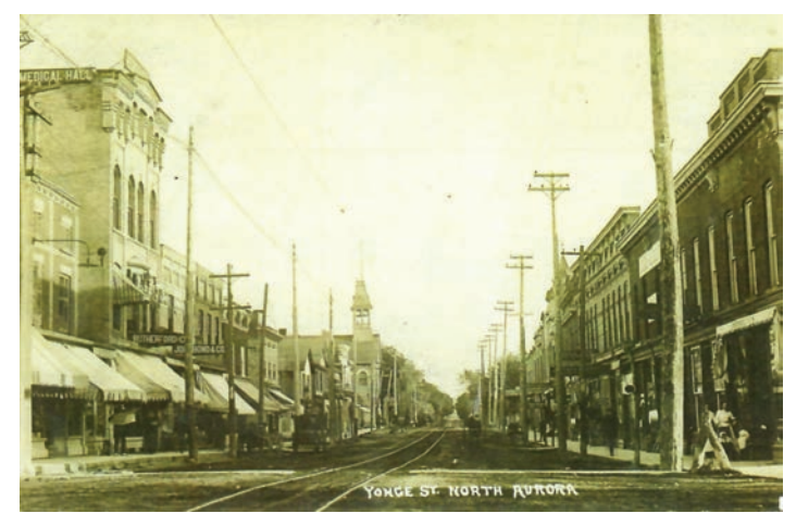
This 1909 image shows Yonge Street looking South from Wellington Street.