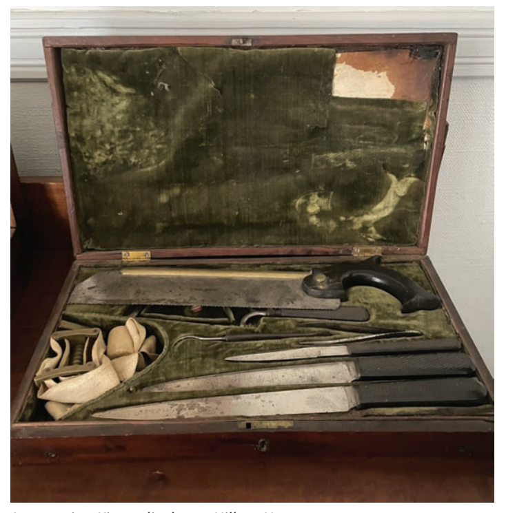
Amputation Kit on display at Hillary House

The major theory during the Victorian Era was the 'Miasma Theory,' a now-defunct understanding that disease and illness were caused by decay and rot (miasmata) emanating into the air, and then causing disease through exposure. Take for example the scarificator. The device was placed on the body and the top lever was pulled, which slashed blades across the skin to induce bleeding. It was used to draw blood out of a sick person in hopes of healing them. A modern audience would not understand the reasoning behind this practice, but to the Victorian mind, this method was completely reasonable. The underlying theory of medicine at the time, prevailing since antiquity, was that the body could only heal itself if the poisons, waste matter, and noxious substances of disease, could be quickly drawn away. It was a system based on Galen's (129 CE-216 CE) humoral system of health. The ancient Greek father of Western medicine reasoned that if all four elements -yellow bile, black bile, phlegm, and blood -- were balanced, then you were in good health.