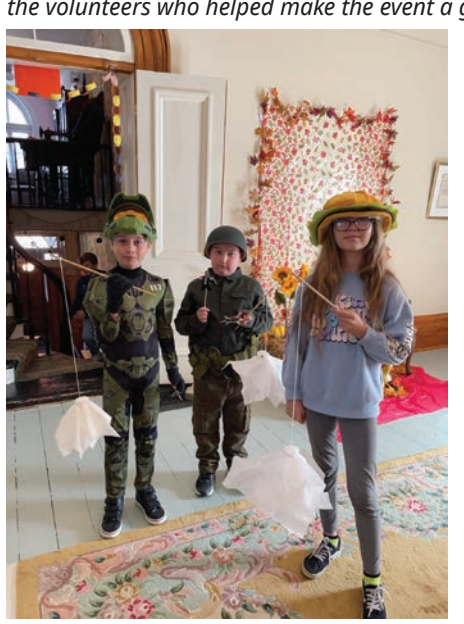
Attendees at A Haunted Halloween at Hillary House enjoy the festivities.