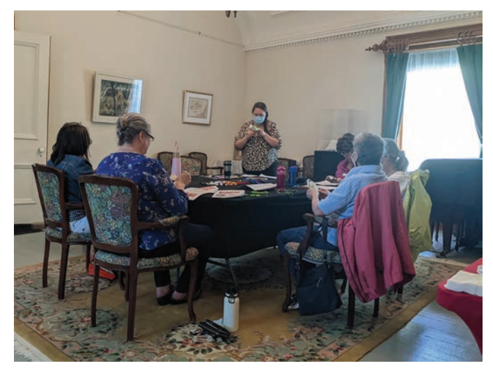
Participants at the Beginners Hand Embroidery Workshop learn the basics of the craft.