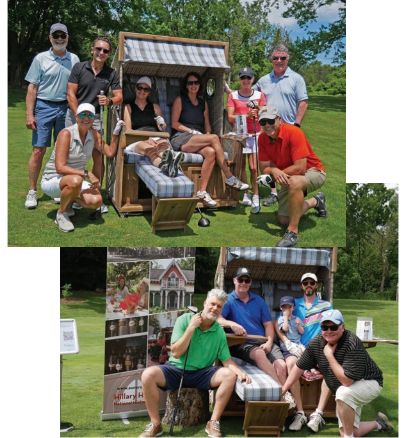
Golfers enjoying the green while supporting Hillary House at the AHS Golf Tournament. Thank you to all of the sponsors, golfers, and volunteers who made the day successful.