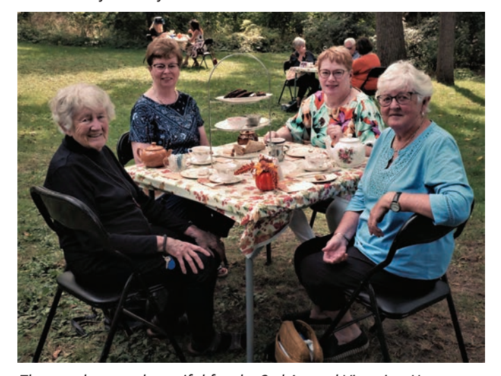
The weather was beautiful for the 3rd Annual Victorian Harvest Tea in September. Guests enjoyed a delicious meal prepared by the Aurora Legion Ladies Auxiliary and Hurst Bakery. Thank you to the volunteers who helped make the event a great success.